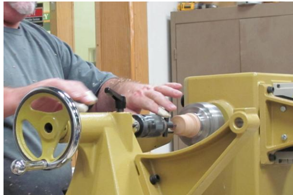
Cylinder that remains after the finial is parted off. It will be used for the top.