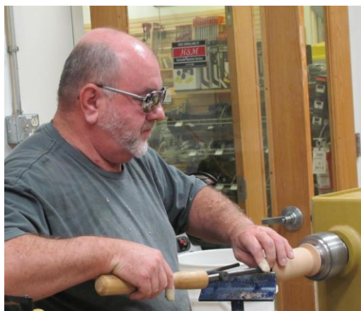
Hollowing after predrilling with forstner bit.