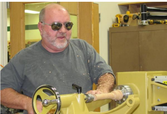
Additional roughing for finial. It is then parted off leaving the end for the top of the ornament.