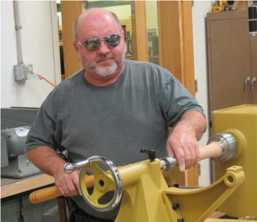
Initial roughing to a cylinder.