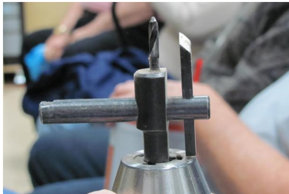
Close up of the modified circle cutter.