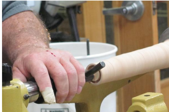
Modified circle cutter is used to cut tenon and bevel the end.