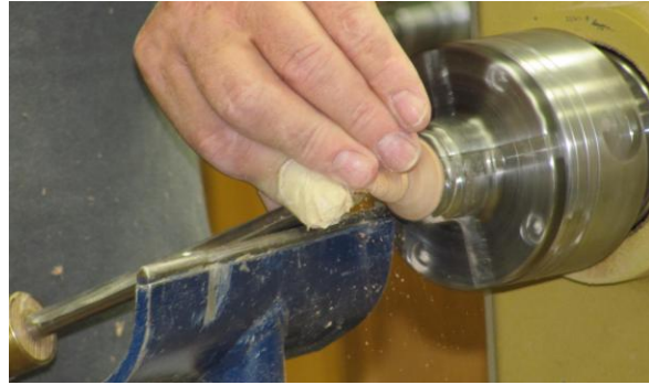
Final turning of the top of the ornament.