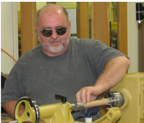
Starting the final turning of the finial.

Final turning and sanding of the finial.