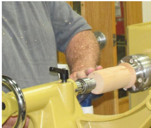
New piece for the main body of the ornament.