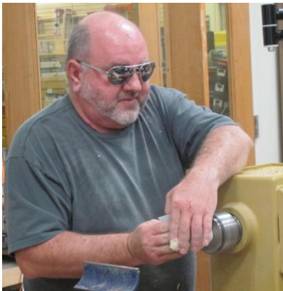
Quick sanding to 220 grit.

Lacquer sealer applied and heat from friction quickly gives a dry surface.