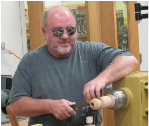
Hollowing is complete; body is parted off.

Body is mounted on modified pin jaws to fit the 7/8" opening. Note the PVC collar to give a solid face for the body (shoulder) to mount on the pin jaws.