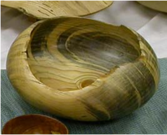
One of Walt Ahlgrim's favorite turning projects made from pine.