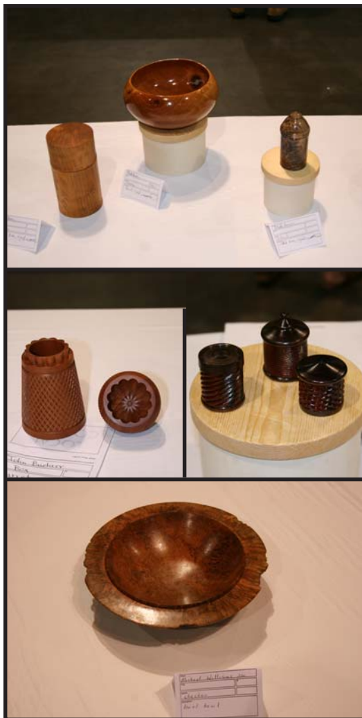
Above: These are a few of our club members pieces on display in the instant gallery

The most impressive display was the Instant Gallery where each attendee could bring up to three pieces. This exhibit was open to all members who attended and was not juried. Many of our members had turnings on display in the instant gallery.