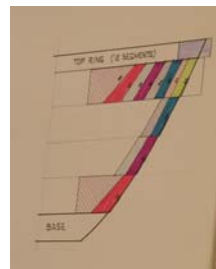
Left: Shows the steps to make a segmented bowl