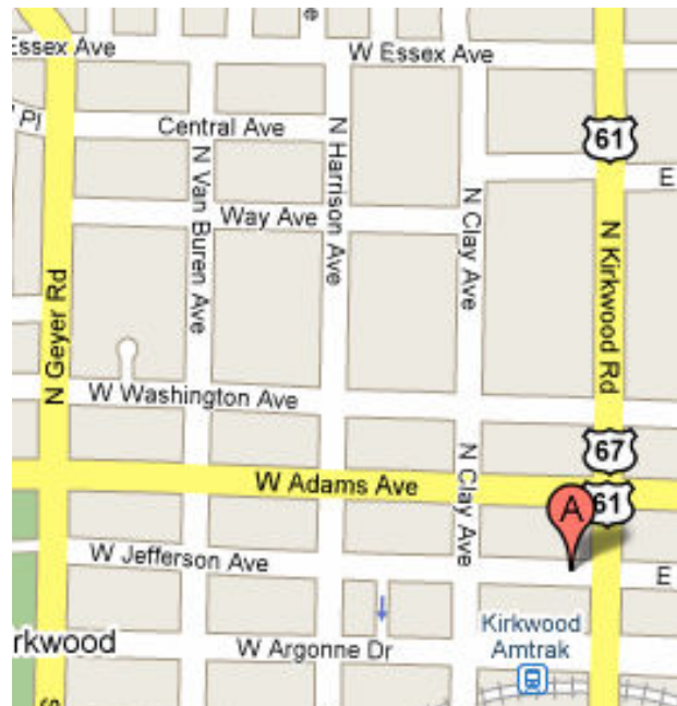
Location of Jefferson Grill

During the events Nick will demonstrate or teach participants how to make the following: honey dipper, baby rattle, goblet, salt urn, wine stopper, peppermill, burnt edge plate or platter, textured edge plate or platter.