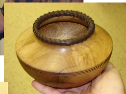
2942 or www.garrettwade.com to order). He also shared a sassafras bowl with textured surface and dyed with a purple marker.