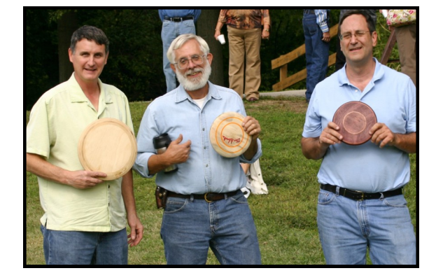
Toss Contest Winners