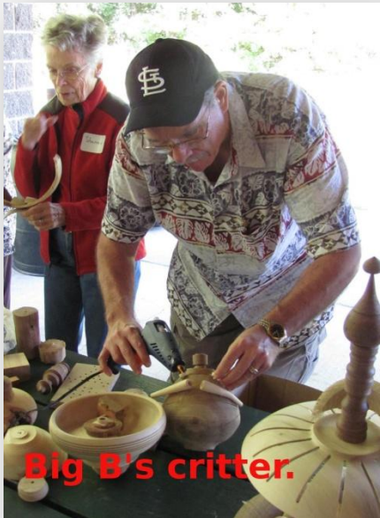
Big B's critter.