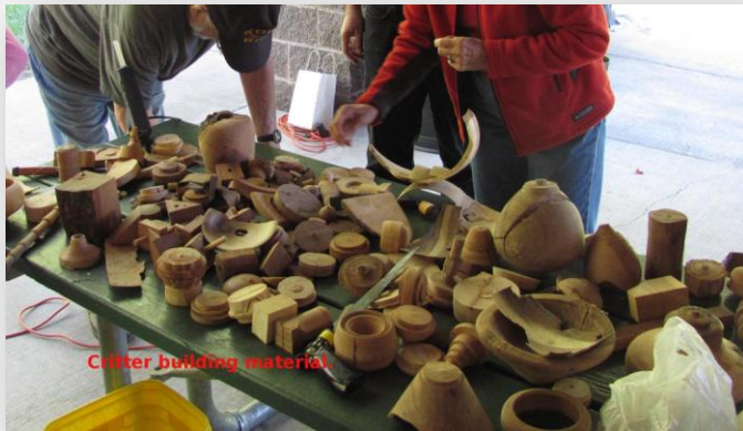
Critter building material