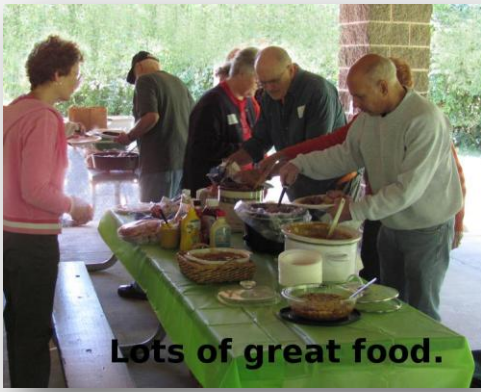
Lots of great food.