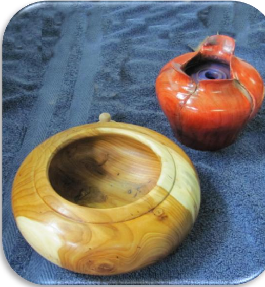
Charles Sapp – hollow form from Trent Bosch hands on and cedar crotch bowl.