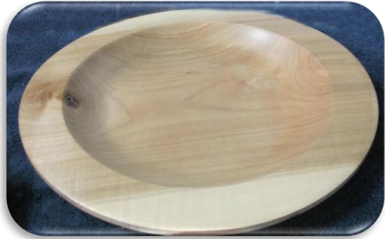
Charles Sapp – silver maple platter (turned green and shaped by Mother Nature or organic turning as Trent Bosch calls it).