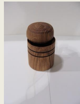
Jason Hill – Oak lidded box