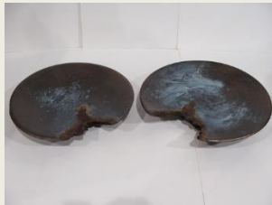
Tom Zeller – Various bowls finished with metallic paint