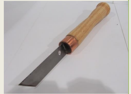
Jesse Tutterrow – Thin Parting Tool