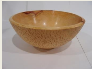
Charles Sapp – Oak inside out turning. Box Elder bowl finished with tung oil and poly (Bill Rubenstein bowl)