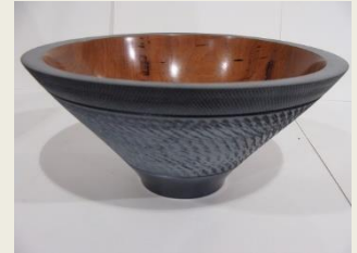
Bill Farny – Maple bowl finished with poly gloss. Cherry bowl poly gloss inside and textured/painted outside