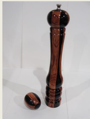
Jeff Nasser – Both are Tulipwood and Black Ebony. Peppermill is finished with lacquer and the egg with CA glue