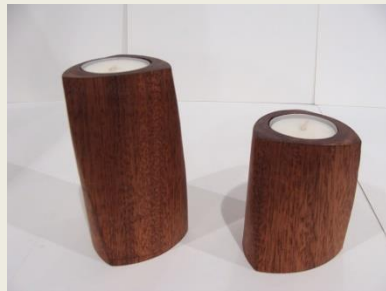
Laura Spelbring – Mahogany votive candle holder.