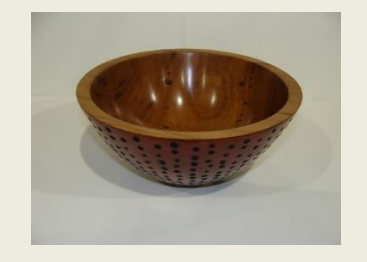
Bill Farny – Cherry textured bowl with milk paint. Cherry bowl finished with poly