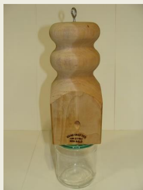
Ken Bald – Carpenter Bee trap