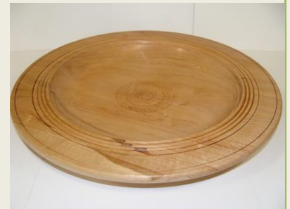
Tom Zeller – Maple platter