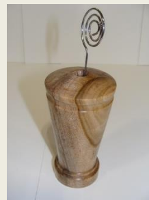
Tom Zeller - Camphor and Silver Maple finished with oil and Hampshire Grit