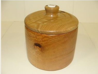
Don Eskridge – Red oak finished with wipe on poly

Web site ● If you have not signed on to the club web site but want to establish an account send your request to the Treasurer, Charles Sapp. Once your membership is verified, an account will be established for you with a temporary password. When you sign on for the first time you will be able to set your own password. If you would like to be featured on the home page, provide Jon Spelbring with 4 to 6 good quality pictures (640 x 480) of your turnings with the same background. You can also establish your own gallery! If you have any problems with web site operation, downloading, or general suggestions please contact the officers.