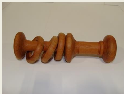
Rob Conaway – Cherry captive ring baby rattle finished with beeswax