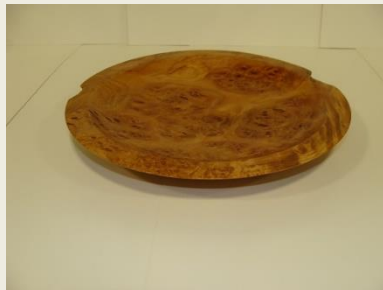
Dick Maes – Maple Burl plate finished with tung oil