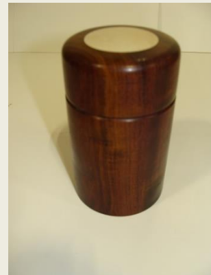
Jeff Nasser – Walnut and Holly lidded box