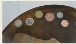
Murray Meierhoff – Sugar Maple Dough Bowl with European coins in the base with epoxy