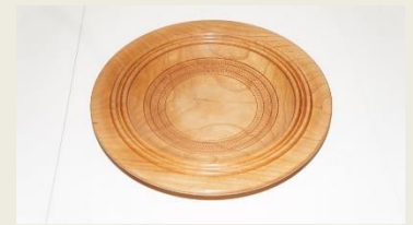
Tom Zeller – Cherry plate, maple plate and a Spalted maple lidded box finished with Yorkshire grit