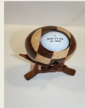
Charles Sapp – Maple and Walnut Sphere in a sphere