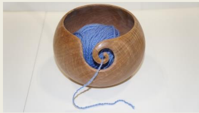
Walt Ahlgrim – Maple Yarn bowl