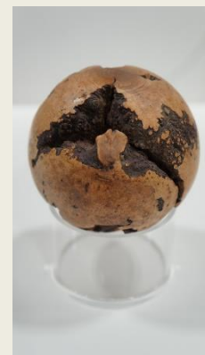
Charles Schrock – Briar Burl Ball finished with Tung oil