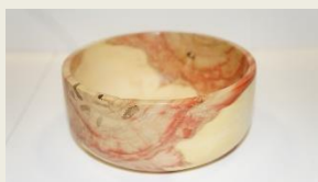
Don Eskridge – Box Elder bowl finished with paste wax. Mahogany tea light stand finished with Doctors.