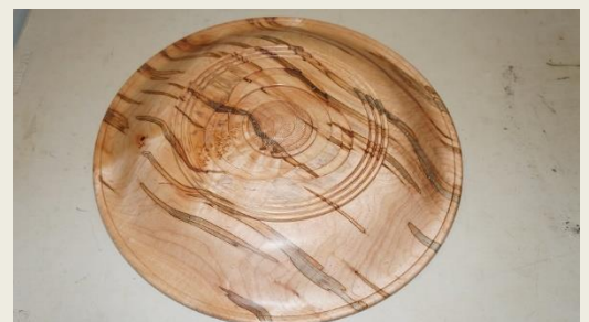
Tom Zeller – Maple plate