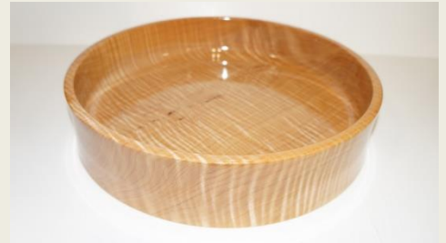
Gary Guzy – Curly Maple bowl finished with wipe on poly