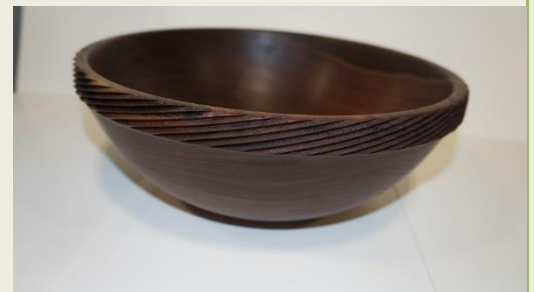
Ken Bald – Walnut bowl with textured rim