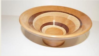
Dan Hill – Bowl from a board made with Walnut, Cherry and Maple. Finished with Beal system