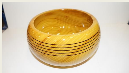
Bill Eggers – Osage Orange bowl