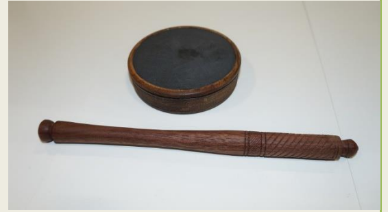
Charles Yonk – Turkey call