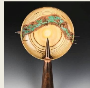
Jeff Hornung – "Road To Recovery" – Birch plywood & Ipe finished with Yorkshire Grit and Reactive Paint