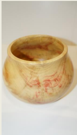
Ken Bald – Box Elder vessel