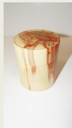
Don Eskridge – Box Elder lidded box finished with Doctors Friction