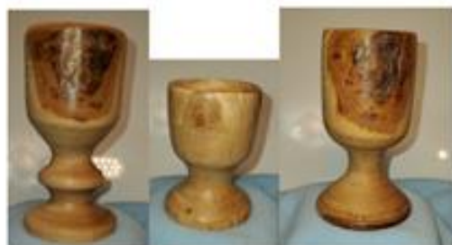
Small cups showing bark area from local tree branch.