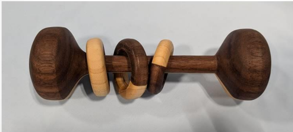
August President's Challenge Winner