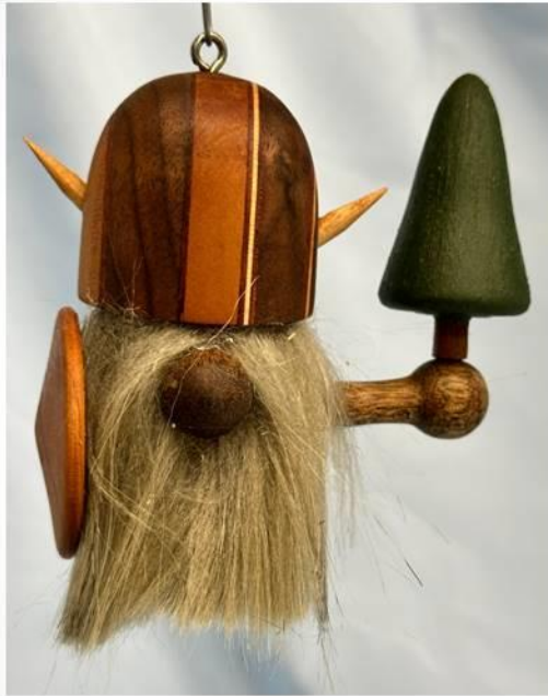
November President's Challenge Winner