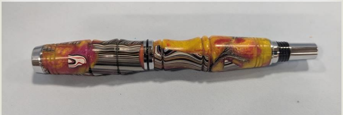
Alumilite casting with Fordite (layers of paint)