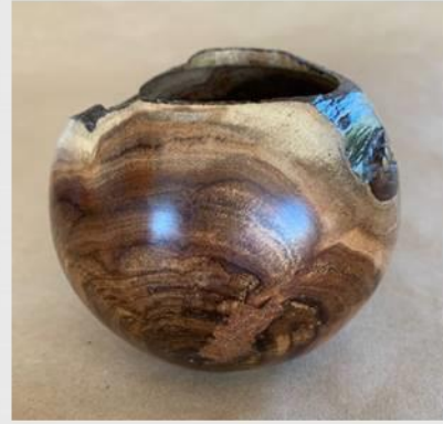
Olive and Mesquite

Our URL is WTSTL.com . If you have issues or questions, contact the web master. Items submitted for the Show and Tell are now being displayed on the home page of the web.