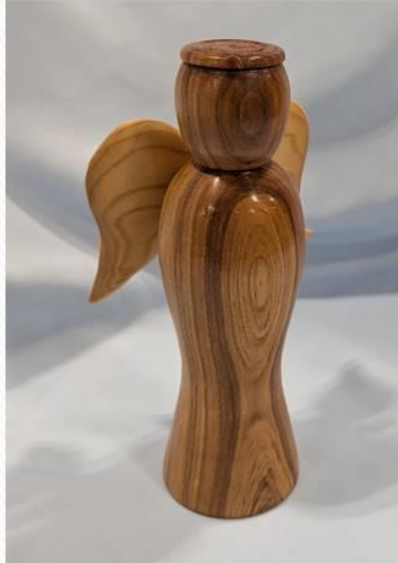
July President's Challenge Winner